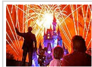
The latest Disney news