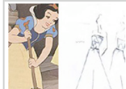
Snow White fashion (WALT DISNEY CO. (LEFT) DESIGNER LOFT PRODUCTIONS)